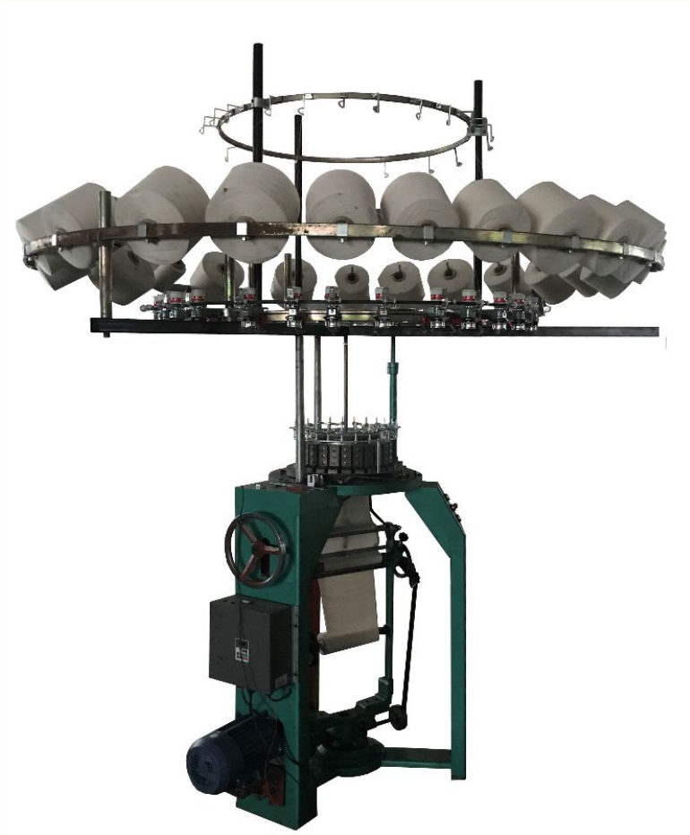
Model: QJY-WD-236 ( Top creel )